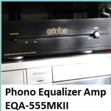
Phono Equalizer Amp EQA-555MKII