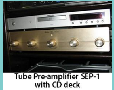
Tube Pre-amplifier SEP-1 with CD deck