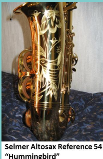
Selmer Altosax Reference 54 "Hummingbird"