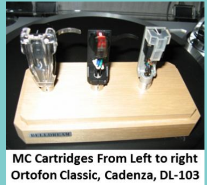
MC Cartridges From Left to right Ortofon Classic, Cadenza, DL-103